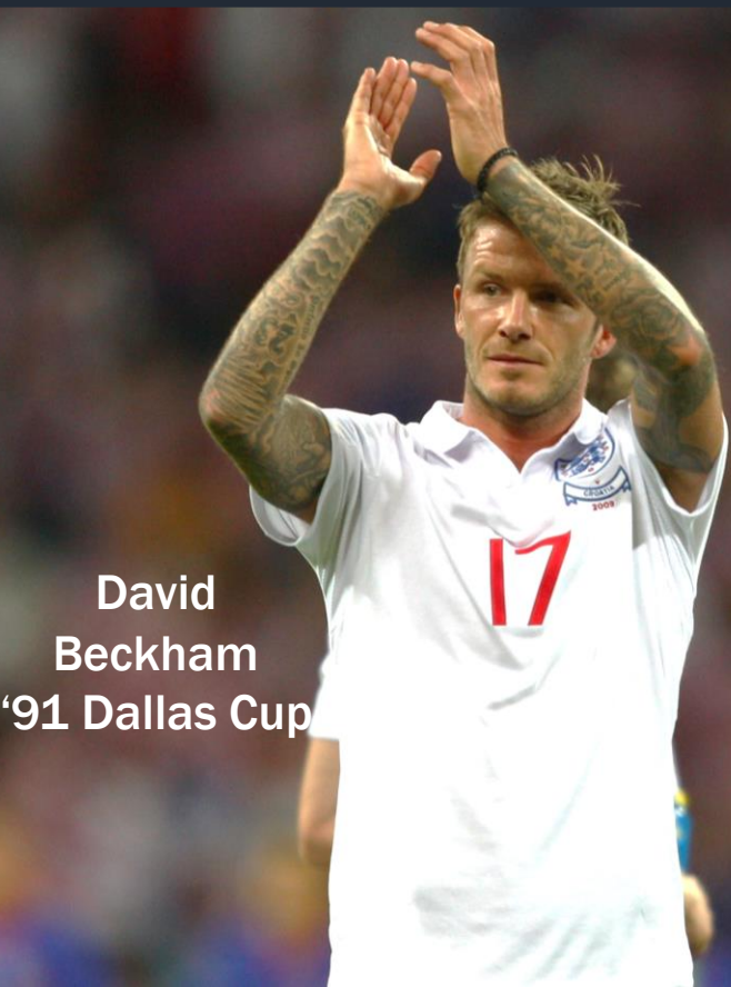
David Beckham '91 Dallas Cup