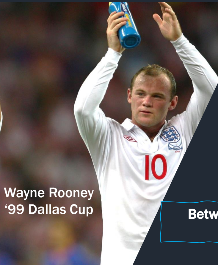
Wayne Rooney '99 Dallas Cup